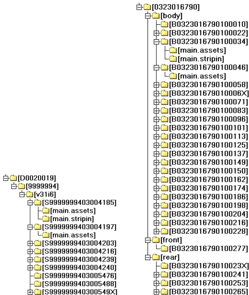
Figure 1: Left – An example of an S300-H300 serial issue dataset directory structure. Right – An example of a Books dataset directory structure.

The element profile-dataset-id is the identifier of the dataset. It is an unrestricted W3C schema token, xs:token . The identifier must be unique per profile-code .