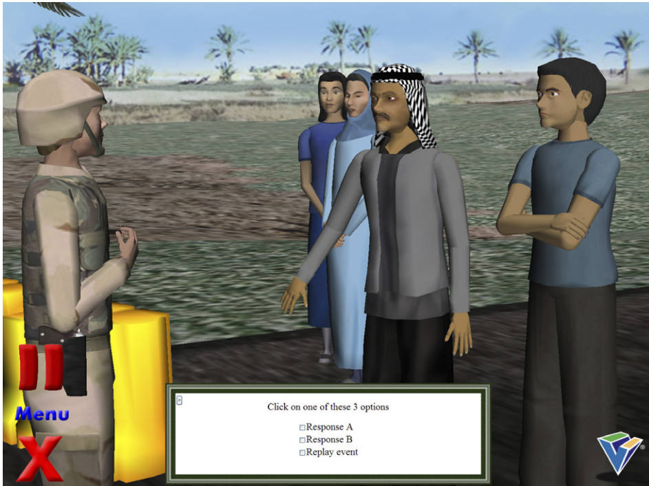
Fig. 4. Online mentors for foreign-language training and cultural familiarization (Sims & Pike, 2007).