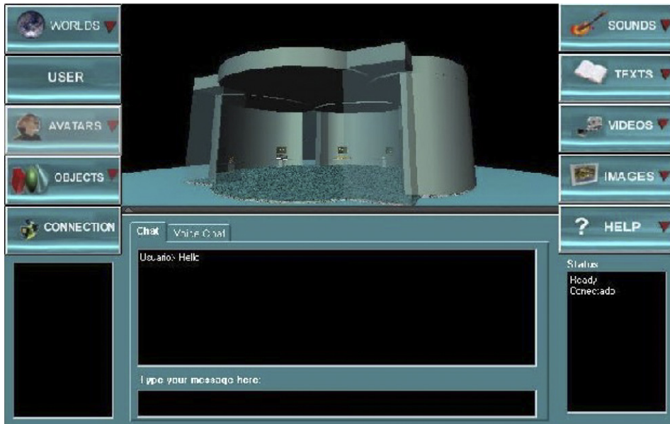
Fig. 1. The CVE-VM application (Kirner et al., 2001).

understanding and goal achievement (Brna & Aspin, 1997). Web3D technologies can provide new tools and scenarios for collaborative learning, connecting people that are physically located in distant places. An example of a collaborative virtual environment (CVE) based on Web3D technologies is CVE-VM (see Fig. 1), that is aimed at supporting teaching and learning in Brazilian schools (Kirner et al., 2001). Children collaborate over the Internet to create their virtual world, thus actively constructing knowledge on the subjects of the world. Following the taxonomy of EVEs proposed by Youngblut (1998), CVE-VM is not a pre-developed application, where students can only interact with the VE, but a multi-user distributed application, where students work together not only to solve problems but also to extend the virtual world. The goal of this type of applications is indeed construction and deepening of knowledge, with a focus on collaboration among students.